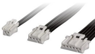
MicroClasp™ Standard Discrete Wire Cable Assemblies

Decreases engineering time and resources