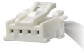
MicroClasp™ Cable Assembly

Provides space savings and easy mating/unmating compared to similar 2.00- and 2.50mm-pitch wire-to-board systems