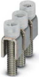
Fixed bridge, Number of positions: 3, Color: silver

Please be informed that the data shown in this PDF Document is generated from our Online Catalog. Please find the complete data in the user's documentation. Our General Terms of Use for Downloads are valid ( http://download.phoenixcontact.com )