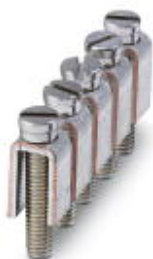
Fixed bridge, pitch: 6.2 mm, number of positions: 5, color: silver

Please be informed that the data shown in this PDF Document is generated from our Online Catalog. Please find the complete data in the user's documentation. Our General Terms of Use for Downloads are valid ( http://phoenixcontact.com/download )