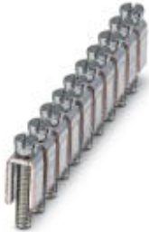
Fixed bridge, pitch: 6.2 mm, number of positions: 10, color: silver

Please be informed that the data shown in this PDF Document is generated from our Online Catalog. Please find the complete data in the user's documentation. Our General Terms of Use for Downloads are valid ( http://phoenixcontact.com/download )