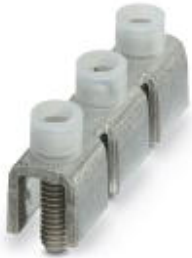
Fixed bridge, Number of positions: 3, Color: silver

Please be informed that the data shown in this PDF Document is generated from our Online Catalog. Please find the complete data in the user's documentation. Our General Terms of Use for Downloads are valid ( http://phoenixcontact.com/download )