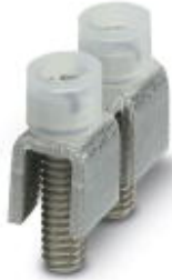
Fixed bridge, Number of positions: 2, Color: silver

Please be informed that the data shown in this PDF Document is generated from our Online Catalog. Please find the complete data in the user's documentation. Our General Terms of Use for Downloads are valid ( http://download.phoenixcontact.com )