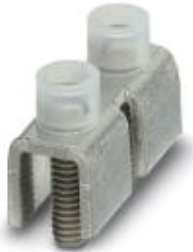
Fixed bridge, Number of positions: 2, Color: silver

Please be informed that the data shown in this PDF Document is generated from our Online Catalog. Please find the complete data in the user's documentation. Our General Terms of Use for Downloads are valid ( http://download.phoenixcontact.com )