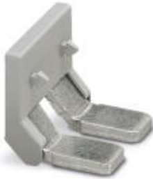
Insertion bridge, Number of positions: 2, Color: gray

Please be informed that the data shown in this PDF Document is generated from our Online Catalog. Please find the complete data in the user's documentation. Our General Terms of Use for Downloads are valid ( http://download.phoenixcontact.com )