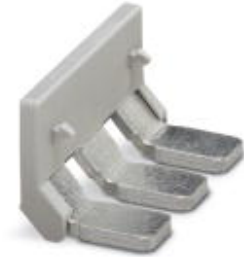
Insertion bridge, Number of positions: 3, Color: gray

Please be informed that the data shown in this PDF Document is generated from our Online Catalog. Please find the complete data in the user's documentation. Our General Terms of Use for Downloads are valid ( http://download.phoenixcontact.com )