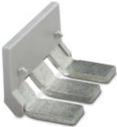
Insertion bridge, Number of positions: 3, Color: gray

Please be informed that the data shown in this PDF Document is generated from our Online Catalog. Please find the complete data in the user's documentation. Our General Terms of Use for Downloads are valid ( http://phoenixcontact.com/download )