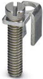
Chain bridge, pitch: 8 mm, number of positions: 1, color: silver

Please be informed that the data shown in this PDF Document is generated from our Online Catalog. Please find the complete data in the user's documentation. Our General Terms of Use for Downloads are valid ( http://phoenixcontact.com/download )