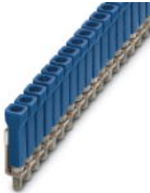
Jumper, Number of positions: 100, Color: blue

Please be informed that the data shown in this PDF Document is generated from our Online Catalog. Please find the complete data in the user's documentation. Our General Terms of Use for Downloads are valid ( http://download.phoenixcontact.com )