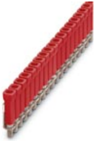
Jumper, Number of positions: 100, Color: red

Please be informed that the data shown in this PDF Document is generated from our Online Catalog. Please find the complete data in the user's documentation. Our General Terms of Use for Downloads are valid ( http://download.phoenixcontact.com )