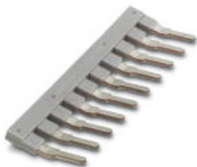
Insertion bridge, pitch: 10 mm, number of positions: 10, color: gray

Please be informed that the data shown in this PDF Document is generated from our Online Catalog. Please find the complete data in the user's documentation. Our General Terms of Use for Downloads are valid ( http://phoenixcontact.com/download )