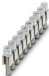
Fixed bridge, Number of positions: 10, Color: silver

Please be informed that the data shown in this PDF Document is generated from our Online Catalog. Please find the complete data in the user's documentation. Our General Terms of Use for Downloads are valid ( http://download.phoenixcontact.com )