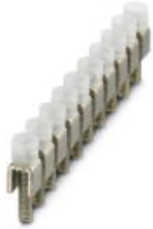
Fixed bridge, Number of positions: 10, Color: silver

Please be informed that the data shown in this PDF Document is generated from our Online Catalog. Please find the complete data in the user's documentation. Our General Terms of Use for Downloads are valid ( http://download.phoenixcontact.com )