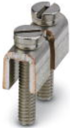
Fixed bridge, pitch: 12 mm, number of positions: 2, color: silver

Please be informed that the data shown in this PDF Document is generated from our Online Catalog. Please find the complete data in the user's documentation. Our General Terms of Use for Downloads are valid ( http://phoenixcontact.com/download )