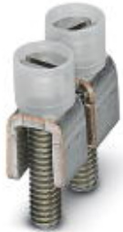
Fixed bridge, Number of positions: 2, Color: silver

Please be informed that the data shown in this PDF Document is generated from our Online Catalog. Please find the complete data in the user's documentation. Our General Terms of Use for Downloads are valid ( http://download.phoenixcontact.com )