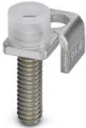
Chain bridge, Number of positions: 1, Color: silver

Please be informed that the data shown in this PDF Document is generated from our Online Catalog. Please find the complete data in the user's documentation. Our General Terms of Use for Downloads are valid ( http://phoenixcontact.com/download )