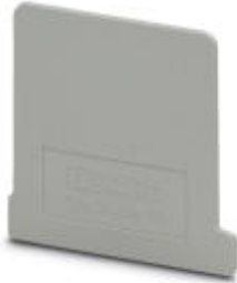
End cover, Length: 42.5 mm, Width: 1.3 mm, Color: gray

Please be informed that the data shown in this PDF Document is generated from our Online Catalog. Please find the complete data in the user's documentation. Our General Terms of Use for Downloads are valid ( http://download.phoenixcontact.com )