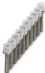
Bridge bar isolator, Number of positions: 10, Color: silver

Please be informed that the data shown in this PDF Document is generated from our Online Catalog. Please find the complete data in the user's documentation. Our General Terms of Use for Downloads are valid ( http://download.phoenixcontact.com )