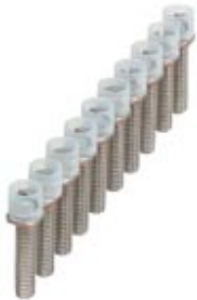
Bridge bar isolator, Number of positions: 10, Color: silver

Please be informed that the data shown in this PDF Document is generated from our Online Catalog. Please find the complete data in the user's documentation. Our General Terms of Use for Downloads are valid ( http://download.phoenixcontact.com )