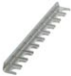
Fixed bridge, Number of positions: 10, Color: silver

Please be informed that the data shown in this PDF Document is generated from our Online Catalog. Please find the complete data in the user's documentation. Our General Terms of Use for Downloads are valid ( http://phoenixcontact.com/download )