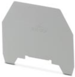
Separating plate, length: 61 mm, width: 0.8 mm, color: gray

Please be informed that the data shown in this PDF Document is generated from our Online Catalog. Please find the complete data in the user's documentation. Our General Terms of Use for Downloads are valid ( http://phoenixcontact.com/download )