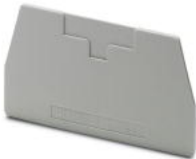
End cover, Length: 72 mm, Width: 2.2 mm, Height: 41.5 mm, Color: gray

Please be informed that the data shown in this PDF Document is generated from our Online Catalog. Please find the complete data in the user's documentation. Our General Terms of Use for Downloads are valid ( http://download.phoenixcontact.com )