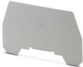
Separating plate, Length: 72 mm, Width: 0.8 mm, Color: gray

Please be informed that the data shown in this PDF Document is generated from our Online Catalog. Please find the complete data in the user's documentation. Our General Terms of Use for Downloads are valid ( http://phoenixcontact.com/download )