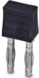
Short-circuit connector, Number of positions: 2, Color: black

Please be informed that the data shown in this PDF Document is generated from our Online Catalog. Please find the complete data in the user's documentation. Our General Terms of Use for Downloads are valid ( http://phoenixcontact.com/download )