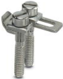
Switching jumper, pitch: 8.2 mm, number of positions: 2, color: silver

Please be informed that the data shown in this PDF Document is generated from our Online Catalog. Please find the complete data in the user's documentation. Our General Terms of Use for Downloads are valid ( http://phoenixcontact.com/download )