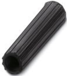
Insulating sleeve, color: black

Please be informed that the data shown in this PDF Document is generated from our Online Catalog. Please find the complete data in the user's documentation. Our General Terms of Use for Downloads are valid ( http://phoenixcontact.com/download )