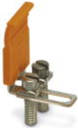
Switching jumper, Number of positions: 2, Color: silver

Please be informed that the data shown in this PDF Document is generated from our Online Catalog. Please find the complete data in the user's documentation. Our General Terms of Use for Downloads are valid ( http://phoenixcontact.com/download )