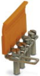
Switching jumper, pitch: 8.2 mm, number of positions: 4, color: silver

Please be informed that the data shown in this PDF Document is generated from our Online Catalog. Please find the complete data in the user's documentation. Our General Terms of Use for Downloads are valid ( http://phoenixcontact.com/download )