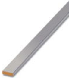
PEN conductor busbar, 3mm x 10 mm, length: 1000 mm

Please be informed that the data shown in this PDF Document is generated from our Online Catalog. Please find the complete data in the user's documentation. Our General Terms of Use for Downloads are valid ( http://download.phoenixcontact.com )