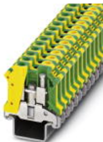
Ground modular terminal block, Connection method: Screw connection, Cross section: 0.5 mm 2 - 16 mm 2 , AWG 20 - 6, Width: 10.2 mm, Color: green-yellow, Mounting type: NS 35/15-2,3

Please be informed that the data shown in this PDF Document is generated from our Online Catalog. Please find the complete data in the user's documentation. Our General Terms of Use for Downloads are valid ( http://download.phoenixcontact.com )