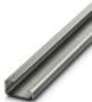
G-profile DIN rail, material: Steel, unperforated, height 15 mm, width 32 mm, length 2 m

DIN rail - NS 32 UNPERF 2000MM - 1201015