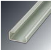
G rail 32 mm (NS 32)

DIN rail - NS 32 AL UNPERF 2000MM - 1201028