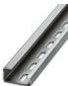
G-profile DIN rail, material: Steel, perforated, height 15 mm, width 32 mm, length 2 m