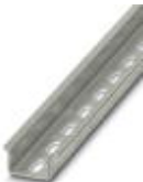
DIN rail, material: steel galvanized and passivated with a thick layer, perforated, height 15 mm, width 35 mm, length: 2000 m

DIN rail perforated - NS 35/15 PERF 2000MM - 1201730