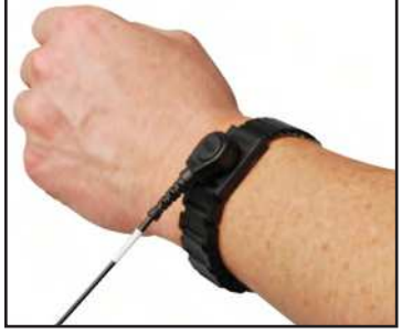
Wrist Strap Assembly. Cord snapped to Wristband