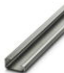
G-profile DIN rail, material: Steel, unperforated, height 15 mm, width 32 mm, length 2 m

DIN rail - NS 32 UNPERF 2000MM - 1201015