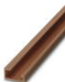
G-profile DIN rail, deep-drawn, material: Copper, unperforated, height 15 mm, width 32 mm, length 2 m

DIN rail - NS 32 CU/120QMM UNPERF 2000MM - 1201280