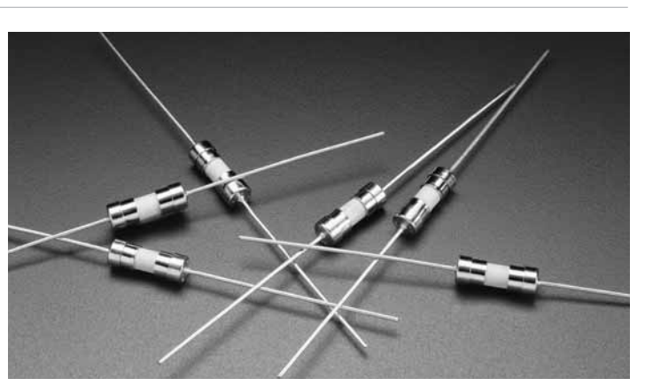
676 000 Series