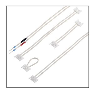
Flexi-Mate<sup>™</sup> 24 AWG Cable Assemblies