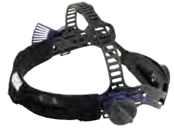
New headband with smooth ratchet for precise tightening.

Additionally, these helmets' affordable price and ease of use ensures that their superior quality and expressive style are accessible to even the most occasional welders.