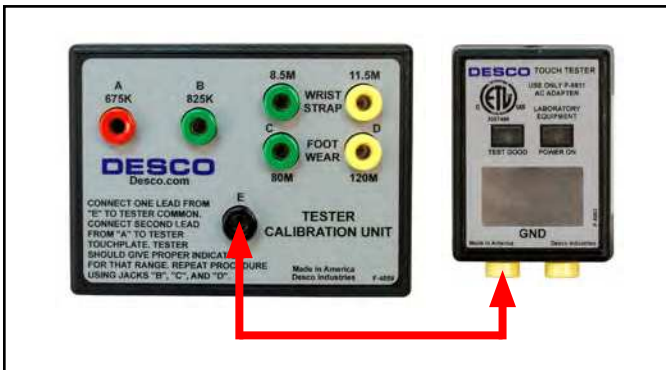
Figure 8. Connecting the test lead from banana jack "E" on the Calibration Unit to one of the banana jacks on the Wrist Strap Touch Tester