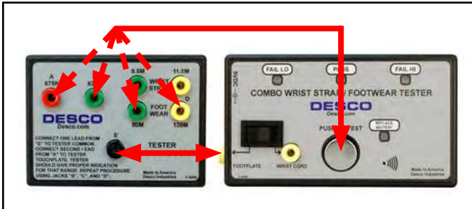
Figure 7. Verifying the calibration of the footwear circuit in the Combo Tester