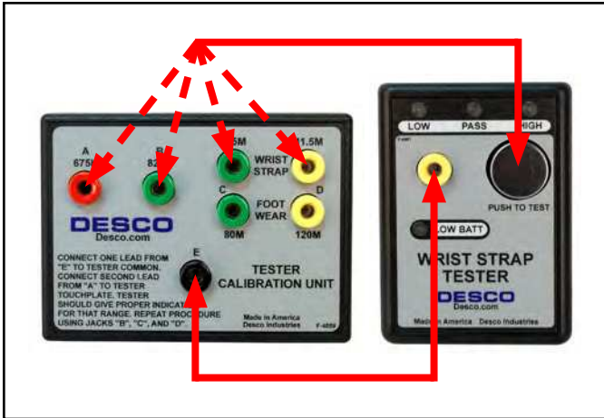
Figure 3. Verifying the calibration of the Wrist Strap Tester