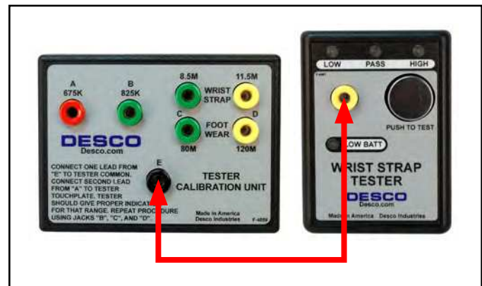
Figure 2. Connecting the test lead from banana jack “E” on the Calibration Unit to the banana jack on the Wrist Strap Tester