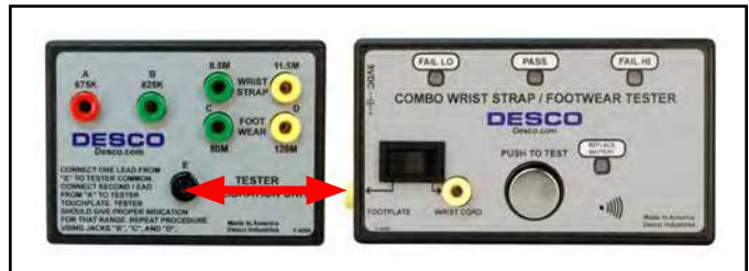
Figure 6. Connecting the test lead from banana jack "E" on the Calibration Unit to the FOOTPLATE banana jack on the Combo Tester