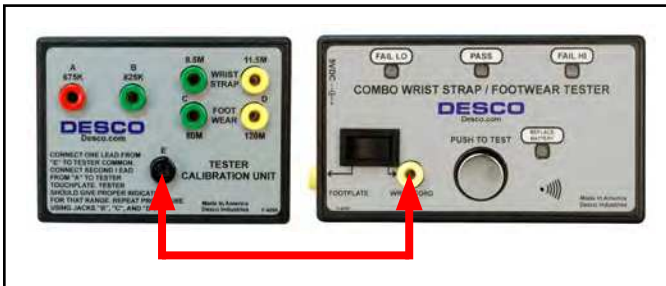
Figure 4. Connecting the test lead from banana jack "E" on the Calibration Unit to the WRIST CORD banana jack on the Combo Tester