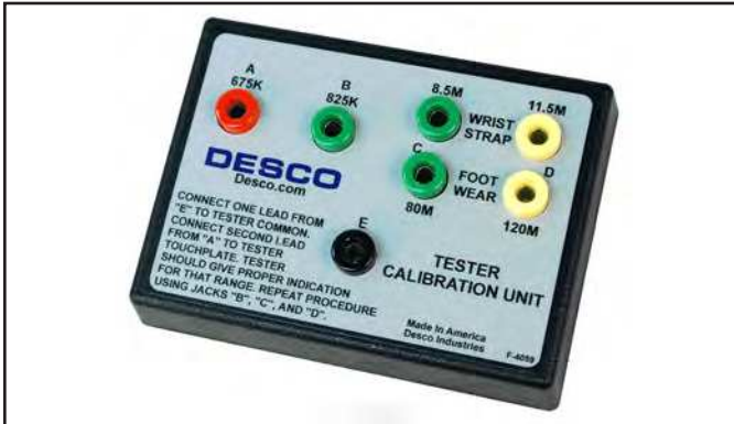
Figure 1. Desco 07010 Calibration Unit