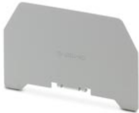
Separating plate, Length: 70 mm, Width: 4.8 mm, Height: 43.5 mm, Color: gray

Please be informed that the data shown in this PDF Document is generated from our Online Catalog. Please find the complete data in the user's documentation. Our General Terms of Use for Downloads are valid ( http://phoenixcontact.com/download )