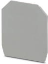
End cover, Length: 52 mm, Width: 2 mm, Color: gray

Please be informed that the data shown in this PDF Document is generated from our Online Catalog. Please find the complete data in the user's documentation. Our General Terms of Use for Downloads are valid ( http://download.phoenixcontact.com )