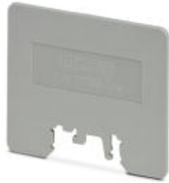
Separating plate, Length: 80 mm, Width: 2 mm, Height: 70 mm, Color: gray

Please be informed that the data shown in this PDF Document is generated from our Online Catalog. Please find the complete data in the user's documentation. Our General Terms of Use for Downloads are valid ( http://download.phoenixcontact.com )