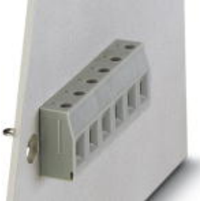
The illustration shows version VDFK 4 in gray

Please be informed that the data shown in this PDF Document is generated from our Online Catalog. Please find the complete data in the user's documentation. Our General Terms of Use for Downloads are valid ( http://download.phoenixcontact.com )