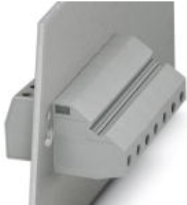
Panel feed-through terminal block, Connection method: Screw connection, Number of positions: 1, Color: green-yellow

Please be informed that the data shown in this PDF Document is generated from our Online Catalog. Please find the complete data in the user's documentation. Our General Terms of Use for Downloads are valid ( http://phoenixcontact.com/download )