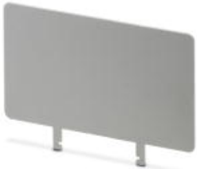
Partition plate, length: 80 mm, width: 2.5 mm, height: 55.3 mm, color: gray

Please be informed that the data shown in this PDF Document is generated from our Online Catalog. Please find the complete data in the user's documentation. Our General Terms of Use for Downloads are valid ( http://phoenixcontact.com/download )