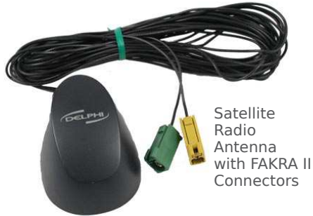
Satellite Radio Antenna with FAKRA II Connectors