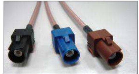
FAKRA II SMB Jacks

73403 FAKRA II SMB Cable Plugs and Jacks