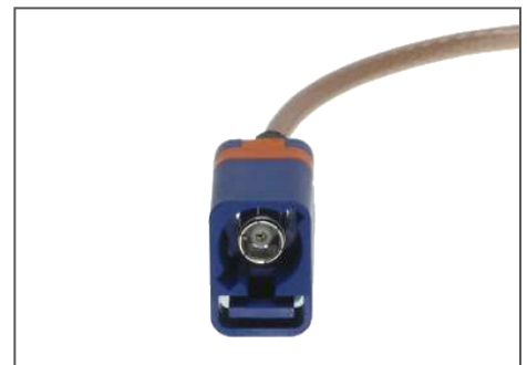
FAKRA II SMB Plug