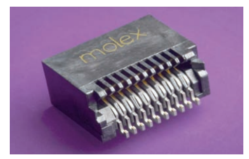
20-Circuit Connector, Series 74441