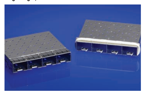
Ganged Cages, Series 74754