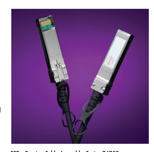
SFP+ Passive Cable Assembly, Series 74752