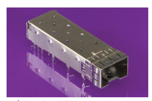
Single Cages, Series 74754