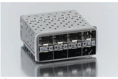
2-by-4 Connector with Elastomeric Gasket, Series 76092