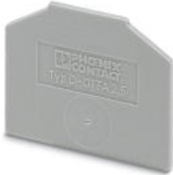
End cover, Length: 43.5 mm, Width: 1.5 mm, Color: gray

Please be informed that the data shown in this PDF Document is generated from our Online Catalog. Please find the complete data in the user's documentation. Our General Terms of Use for Downloads are valid ( http://download.phoenixcontact.com )